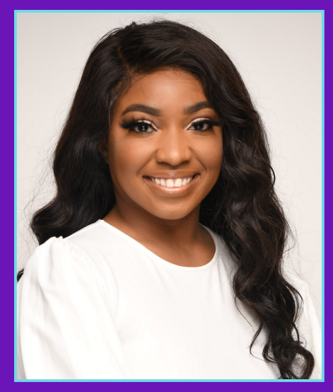
POLICY DIRECTOR MS VOTES

With another Legislative Session behind us, Mississippi Votes is here again to share its recap of major legislation that will potentially change the everyday lives of everyday Mississippians. This session in particular has been like no other where many basic principles of democracy have come under attack or completely ignored.